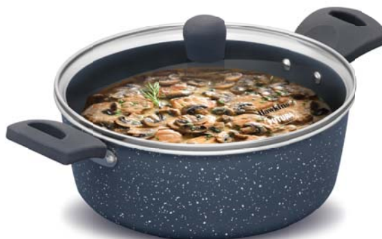
COOK n SERVE BOWL

MRP = MAXIMUM RETAIL PRICE PER UNIT INCLUSIVE OF ALL TAXES IN INDIAN RUPEES