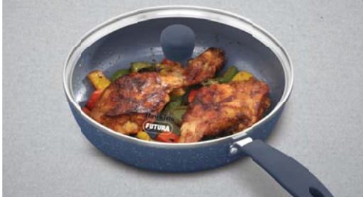
CERAMIC NONSTICK FRYING PAN