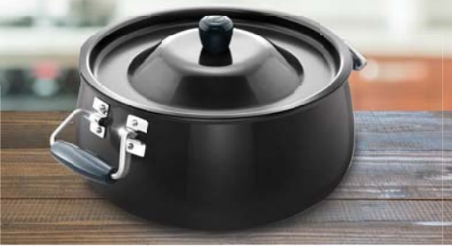
BIGBOY BIRYANI HANDI