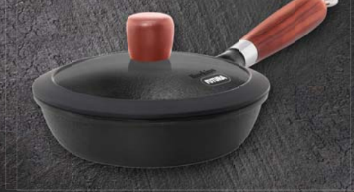
CAST IRON FRYING PAN